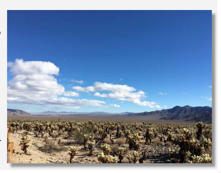
Figure 1. View facing east of the Pinto Basin from Cholla Gardens within Joshua Tree National Park, near one of our study sites; The Blue Cut Fault runs straight through this basin at the base of the Hexie mountains to the right in this image.

Our first step in testing this hypothesis is to determine the most recent fault slip histories of these smaller peripheral left-lateral faults within Joshua Tree National Park (Figure 1). If these faults are inactive, or slowing down, that would imply that block rotation has ceased or is slowing to a stop and is no longer a possible mechanism of strain transfer. To do this, we are employing geomorphic field mapping, LiDAR elevation data analysis, and <sup>10</sup>Be cosmogenic radionuclide surface exposure dating to determine Holocene slip rates on the Blue Cut and Smoke Tree Wash faults.