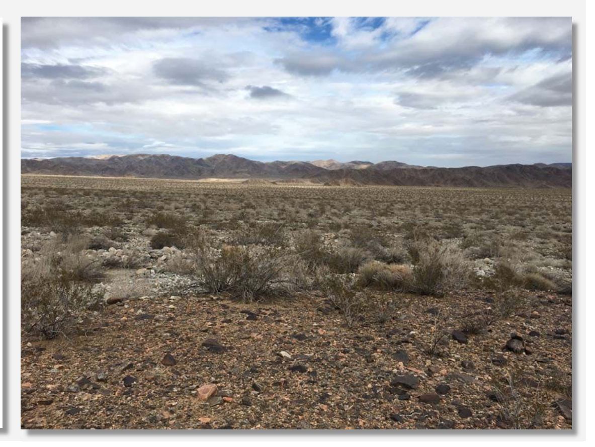
Figure 2. View from one of the preserved surfaces at one of our study sites along the Blue Cut Fault; This looks slightly east of north across the Pinto Basin towards the Pinto Mountains. Notice the flattened, orangecolored, and well-"paved" surface morphology of the preserved surface in the foreground, compared to the active channel deposits just beyond.

Additional information about ongoing work will be presented at this year's GSA and AGU annual meetings.